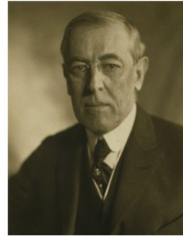
President Woodrow Wilson